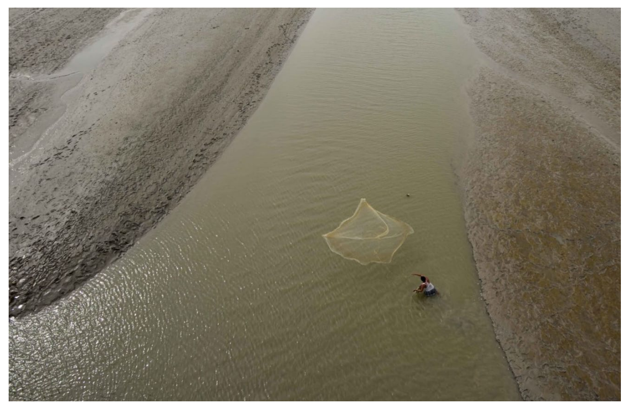
Fishing along the creeks and streams of the Sundarbans is one of the main livelihoods of the people living around the mangrove forest. A large brick room with a double-gabled roof stood adjacent to Kailash Mondol's shop. A hurricane lamp with a low flame was casting a faint glow in the room. A window had

Kuber's boat soon reached the market pier. Many other boats crammed close to his. An inky darkness had spread over the entire sky. So intense was the darkness that you could not see anything even a few feet away. The wind had also started to pick up by now. The Matla seemed to be seething.