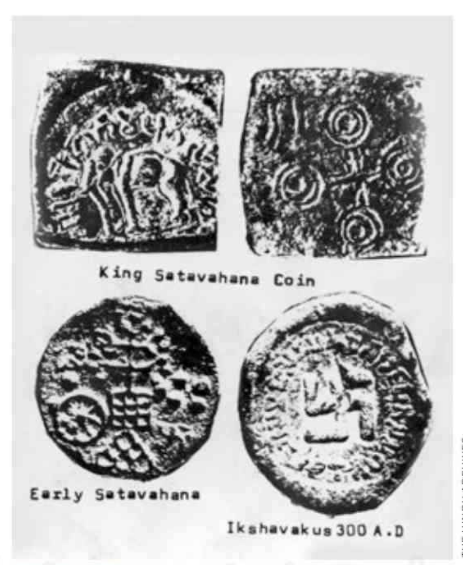
SOME COINS of ancient south India. The second section of Seeking History through Her Source is based on coins and inscriptions and includes some painstaking examination of sources.

Proceeding in a similar vein is the last essay in this volume, which deals with three random samples of early historic art, namely, an ivory statuette from the ancient Deccan that