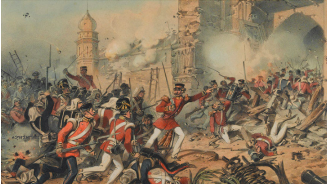
Capture of Delhi, 1857. Coloured lithograph by Bequet Freres | National Army Museum, UK | Wikimedia Commons